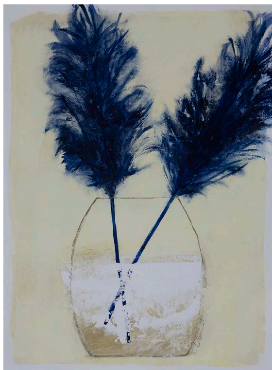
Indigo Pampas Grass 27.56 x 19.69 IN 70 x 50 CM Acrylic on wc paper