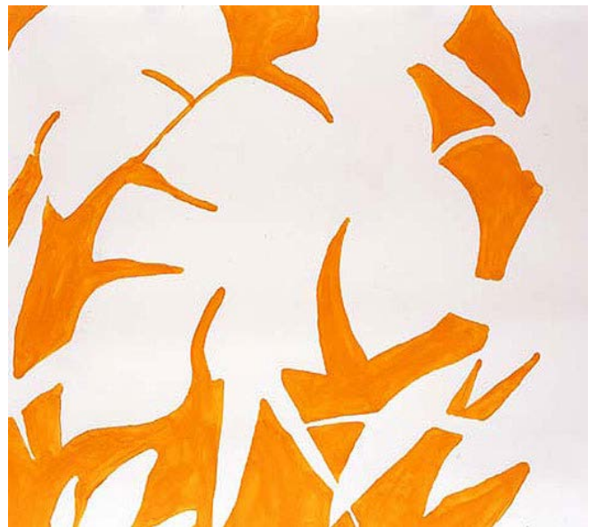
Havana Happy 2 - SOLD Acrylic on wc paper