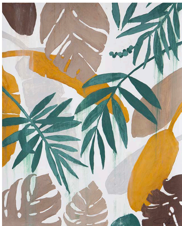
Eastern Palms 1 30 x 24 IN 76.2 x 60.96 CM Acrylic on wc paper