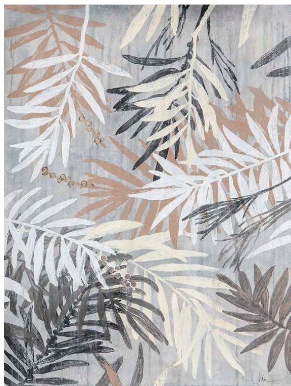
Palms of the East 1 39.37 x 27.56 IN 100 x 70 CM Acrylic on wc paper