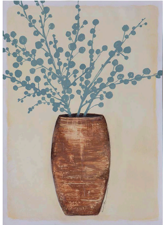
Mediterranean Terracotta 2 27.56 x 19.69 IN 70 x 50 CM Acrylic on wc paper