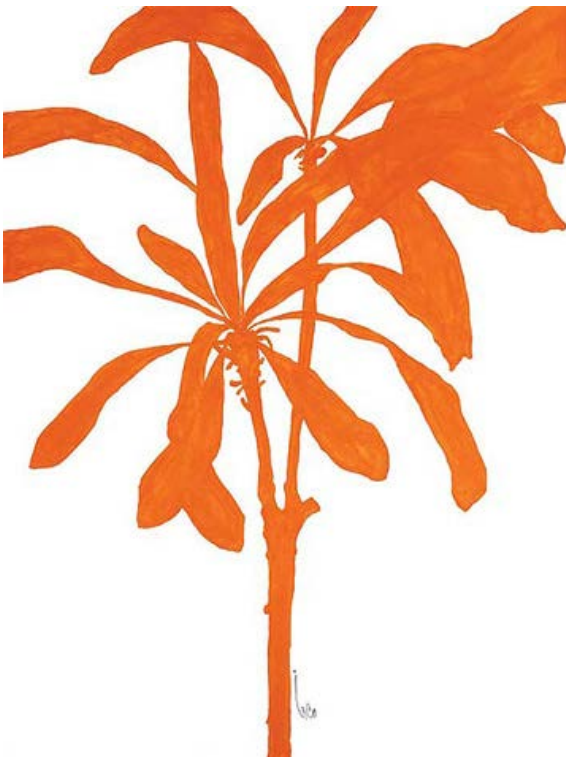
Silhouette of Palm 3 - SOLD Acrylic on wc paper