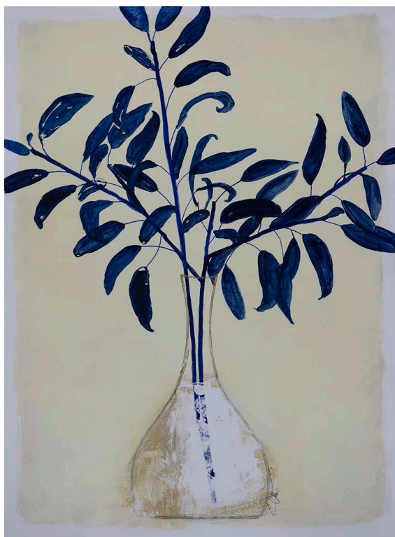
Indigo Ficus 27.56 x 19.69 IN 70 x 50 CM Acrylic on wc paper