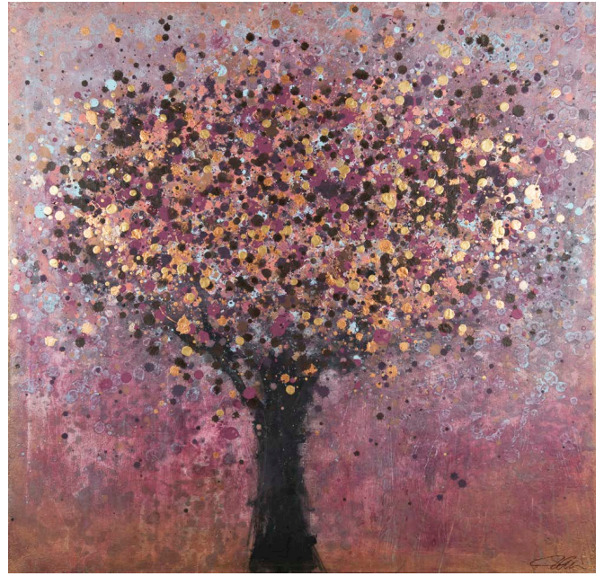
Shimmering Tree - SOLD 36 x 36 IN 91.44 x 91.44 CM Acrylic on Canvas