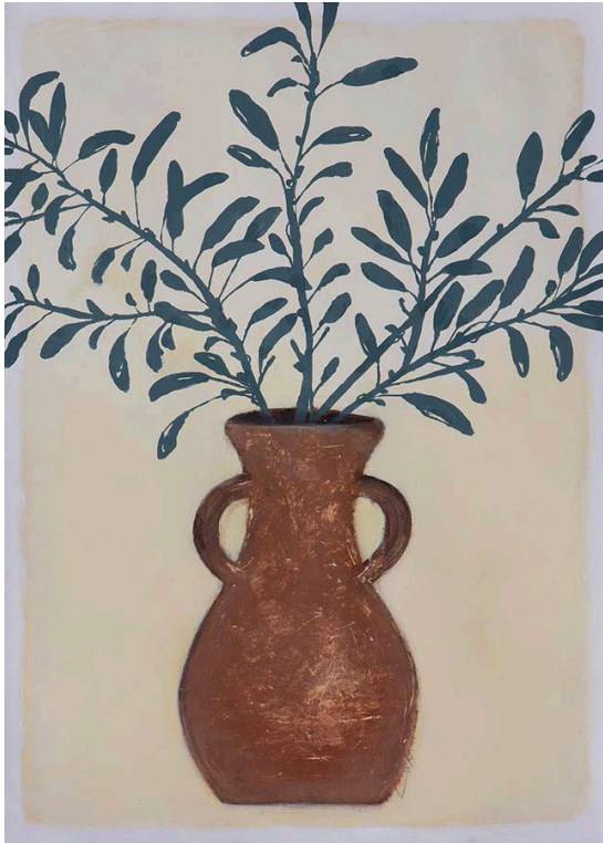
Mediterranean Terracotta 1 27.56 x 19.69 IN 70 x 50 CM Acrylic on wc paper