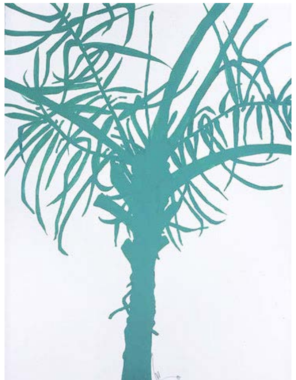
Silhouette of Palm 4 - SOLD Acrylic on wc paper