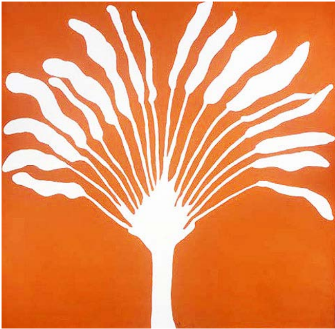
Infatuation - SOLD Acrylic on canvas