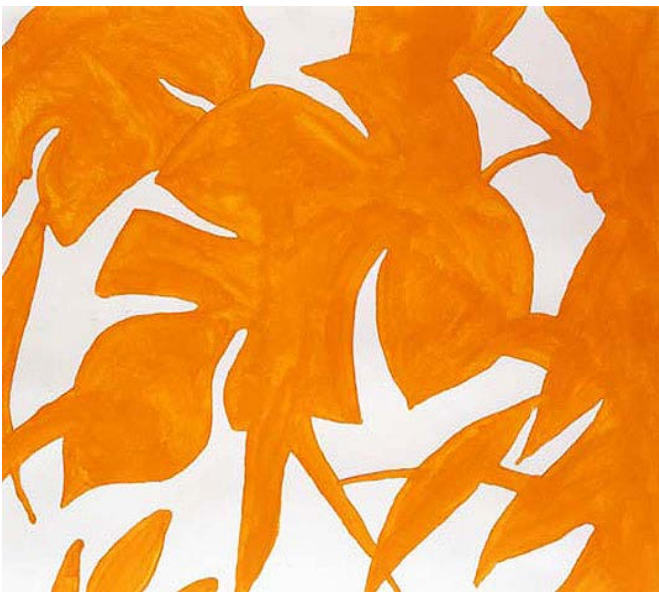
Havana Happy 1 - SOLD Acrylic on wc paper