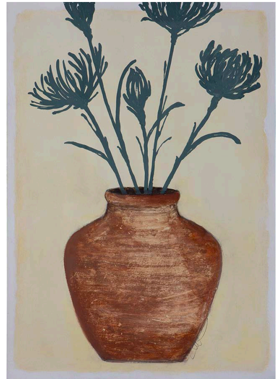
Mediterranean Terracotta 4 27.56 x 19.69 IN 70 x 50 CM Acrylic on wc paper