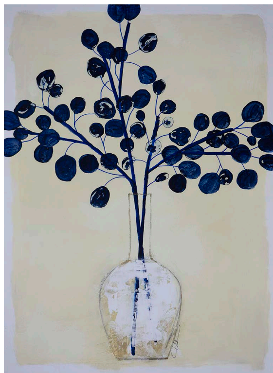
Indigo Silver Dollar 27.56 x 19.69 IN 70 x 50 CM Acrylic on wc paper