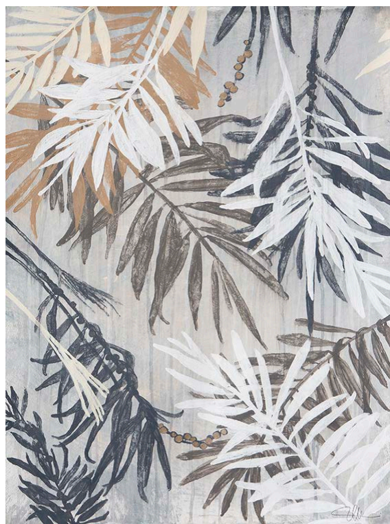
Palms of the East 2 39.37 x 27.56 IN 100 x 70 CM Acrylic on wc paper