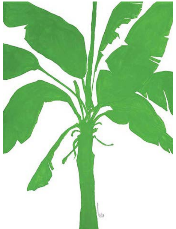
Silhouette of Palm 2 - SOLD Acrylic on wc paper