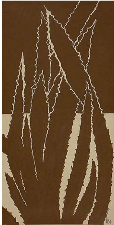
Agave 2 - SOLD Acrylic on wc paper