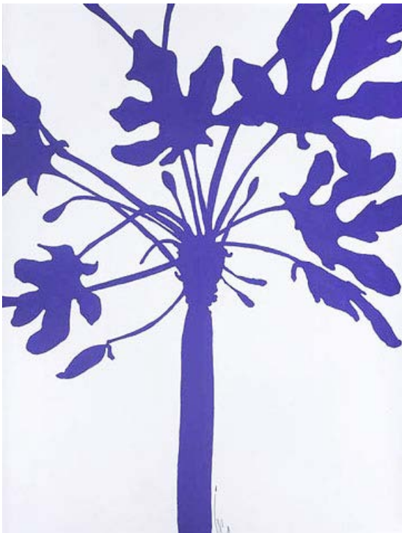
Silhouette of Palm 1 - SOLD Acrylic on wc paper