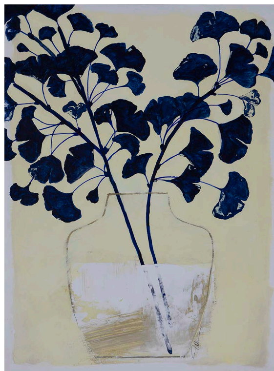
Indigo Ginkgo 27.56 x 19.69 IN 70 x 50 CM Acrylic on wc paper