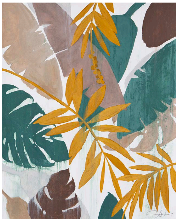
Eastern Palms 2 30 x 24 IN 76.2 x 60.96 CM Acrylic on wc paper