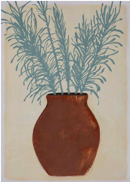
Mediterranean Terracotta 3 27.56 x 19.69 IN 70 x 50 CM Acrylic on wc paper